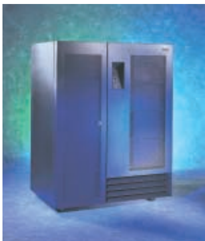
IBM TotalStorage Enterprise Storage Server